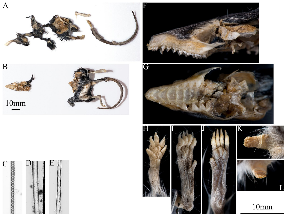
Figure 3. KI dunnart identification. Remains of two dunnarts removed from cat digestive tract are depicted in panel (A) and (B), with hair mounts depicted in panels (C) through (E). Lateral and maxillary occlusal view of the head can be seen in panels (F) and (G), respectively. Panels (I) and (J) depict manus and pes. Panels (K) and (L) depict dorsal and cranial view of penis, respectively.

Birds were not identified down to the species level, and this group represented 18.3% of all tetrapod prey (95% CI 6.6–26.9), followed by macropods (13.9%; 95% CI 6.6–20.8).