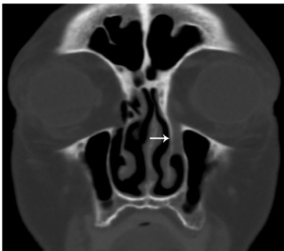
Figure 4 Coronal image illustrating an opacified nasolacrimal duct (arrow). Notes: Due to patient rotation, the contralateral duct cannot be viewed in this frame.