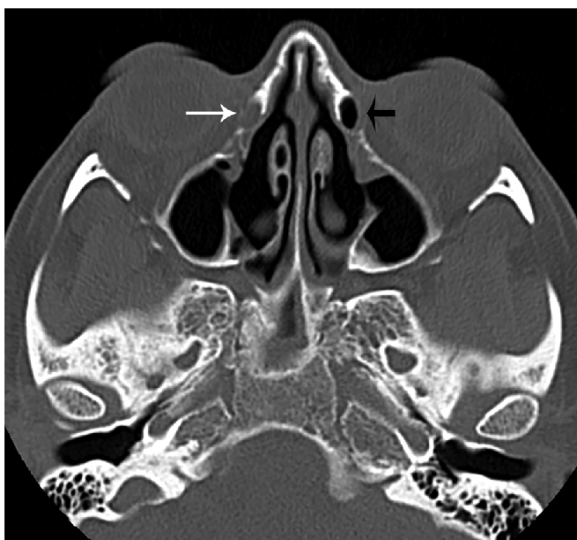
Figure 1 Axial image illustrating a fully opacified (white arrow) and a fully aerated (black arrow) lacrimal sac.

An a priori power analysis was not completed as there were no previously reported data available to estimate the differences in aeration between groups. Chi-square tests were used to test differences in observed frequencies of aeration between the groups. Four patients were scanned in both the upright and supine position. In this case, Fisher’s exact test was used, due to the sparse numbers in each aeration category. Statistical significance was reported at the 0.05 alpha level, with two-tailed P -values. The R statistical package was used for data analysis. 9 The use of multiple comparison correction was not indicated.