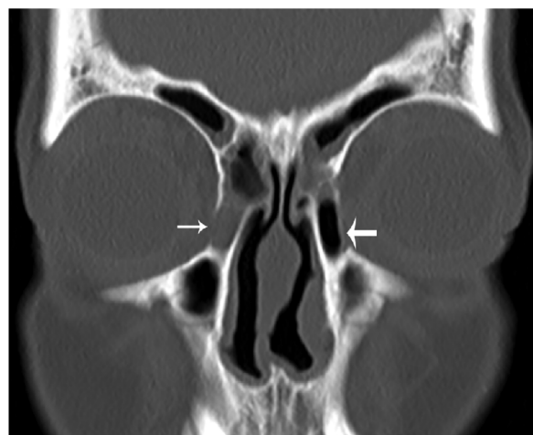
Figure 3 Coronal image illustrating an opacified (small arrow) and a fully aerated (large arrow) lacrimal sac.