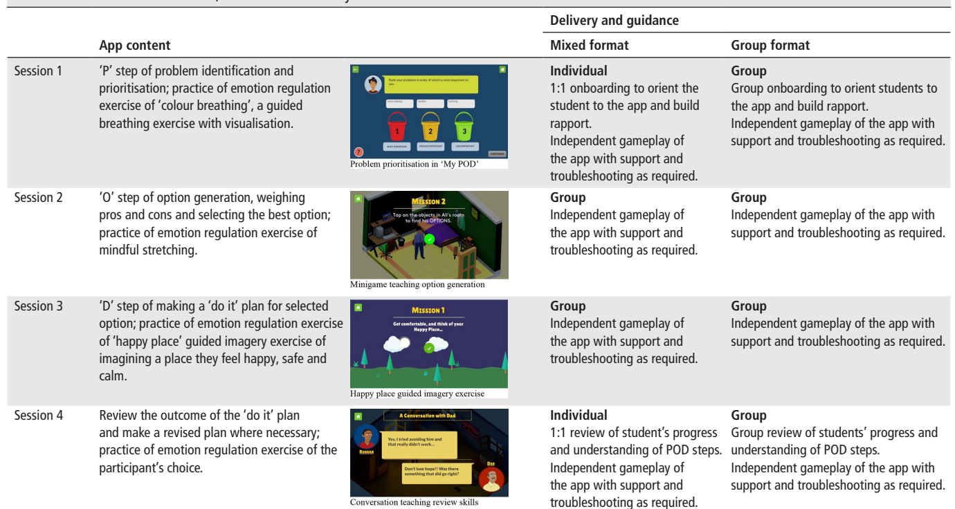
Table 1 Intervention structure, content and delivery

The intervention comprised a smartphone app, ‘POD Adventures’, guided by a lay counsellor. The app was built around three problem-solving steps that had been developed and evaluated for use in non-digital intervention formats through the PRIDE programme 19 20 : (1) ‘Problem identification’; (2) ‘Option generation’; and (3) creating a ‘Do it’ plan. The app content was organised in two sections: (1) Adventures , in which problem-solving concepts and methods were taught through gamified stories along with guided practice of emotion regulation strategies; and (2) My POD , in which a series of questions scaffolded the participant through step-by-step problem solving for their own problems (table 1).