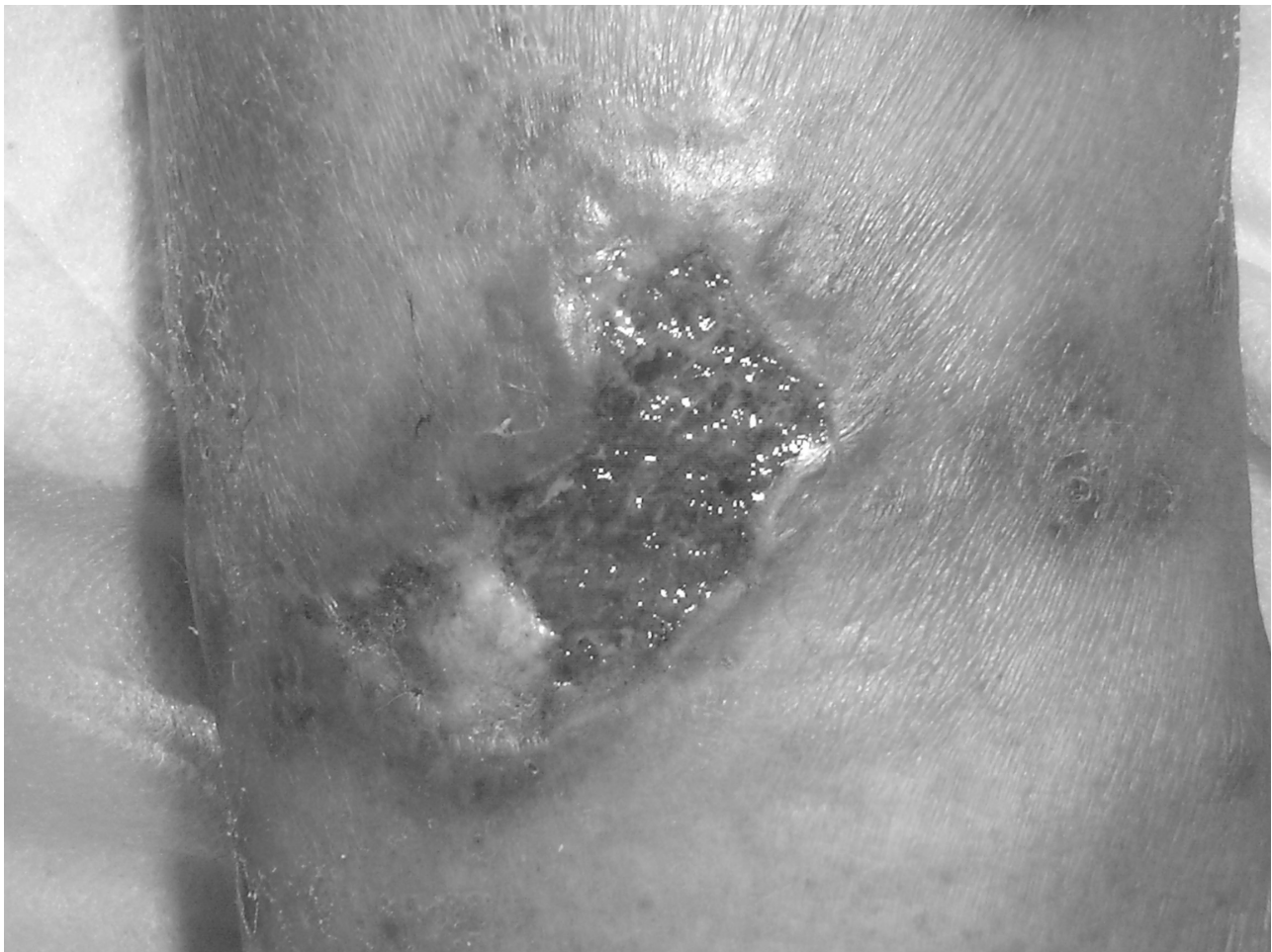
Figure 1 Ulcerated lesion with partial re-epithelization after the tenth day of treatment.

Upon admission and initial evaluation, he was found to have a 7 \times 5 \times 4.5 cm ulcer with heavily infiltrated borders and multiple satellite infiltrated nodular and acneiform lesions measuring 2 cm in diameter with the largest located at only 5 cm from the primary ulcerated lesion (Figures 1 and 2). A Giemsa-stained skin smear revealed the presence of few amastigotes in the lesions (Figure 3) and delayed type hypersensitivity (DTH) skin-test was negative. Histological sections of the lesions revealed a vacuolated granuloma exhibiting large collections of vacuolated and heavily parasitized macrophages surrounded by a lympho plasmacytic infiltrate (Figure 4). Further parasite culture and typification confirmed the presence of Leishmania (Viannia) braziliensis as the etiologic agent.