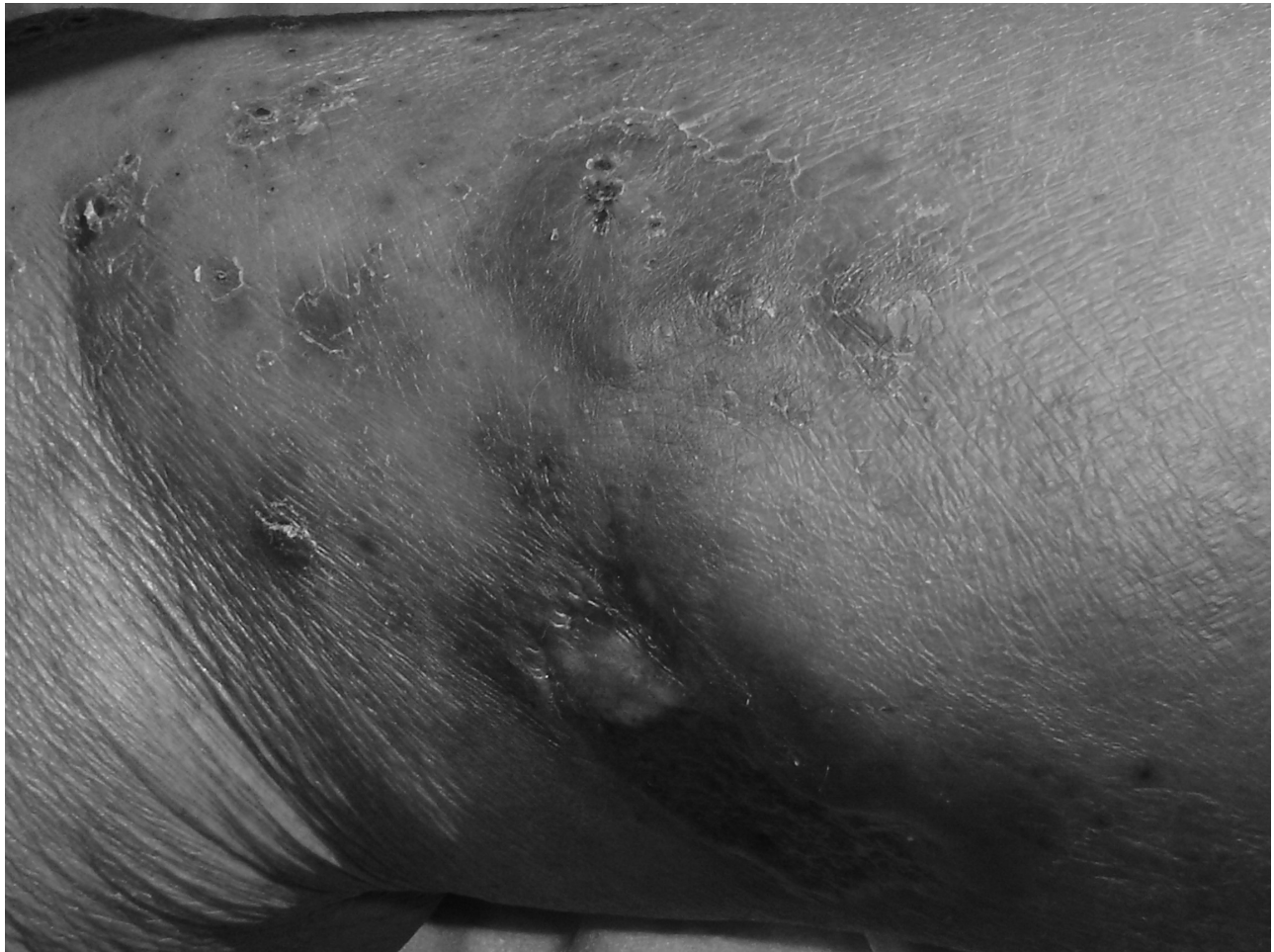
Figure 2 Satellite disseminated acneiform lesions with moderate perilesional infiltration.

The past medical history of the patient was otherwise unremarkable, except for episodes of dyspnea, orthopnea, and palpitations over the last three months. The physical examination revealed jugular vein distention, prominent audible S3 heart sound, and a laterally displaced cardiac apex; rales were audible in both lung bases and mild pitting edema was evident in lower extremities; the rest of the physical examination was unremarkable. A complete cardiovascular workup was initiated to assess the cause of the symptoms. The chest radiography revealed cardiomegaly and discrete bilateral pleural effusions. On echocardiography focal segmental abnormalities were evident mainly in the posteroinferior aspect of the left ventricle with moderate hypokinesia. A conventional 12-lead electrocardiogram (EKG) and a 24-hour Holter monitoring demonstrated the presence of a non-sustained ventricular tachycardia and ventricular extrasystoles.