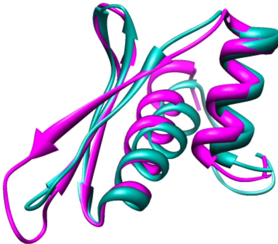
Figure 4 Superimposition of dsRNA-binding motifs. The structures of CRV-ZWE-157 (teal) and DGCR8 (purple) were superimposed using the Matchmaker function of Chimera. The RMSD between these two structures was 1.67 Å over 62 alpha carbon pairs.

As discussed above, the CRV-ZWE-157 protein is not an ortholog of the VACV-Copenhagen E3L RNA-binding protein. The CRV gene is located approximately 25 kb from the right end of the genome in a region mostly populated by hypothetical genes of unknown function that are unique to CRV. Thus, there is little information to be gleaned from the location of this gene to indicate a possible origin. However, it is interesting that the CRV-ZWE-157 gene contains only 51.3% G+C, which is relatively low for the CRV genome, whereas the set of 80 core chordopoxvirus CRV genes have a G+C range of 52-76% with a mean of 64% and the non-core CRV genes have a G+C range of 45-73% and a mean of 59%. Thus, this gene and flanking regions appear to be distinct from the bulk of the genome and the comparatively low G+C content of CRV-157 offers support for its acquisition from the host. There are also numerous