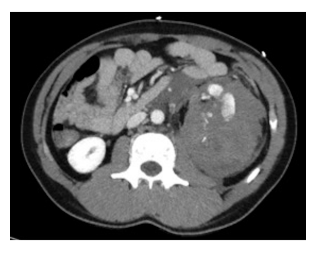
Figure 1. CT abdomen axial section showing shattered left kidney.

decision was made to proceed to open left nephrectomy. The operation was performed with a midline incision and a transperitoneal approach to achieve vascular control prior to opening the Gerota's fascia. Evacuation of a large left perinephric hematoma was performed. The kidney was shattered into 3 pieces separated from the renal pelvis (Fig. 3). Post-operatively the patient developed an ileus but otherwise had an uneventful recovery and discharged at day 21 post injury.