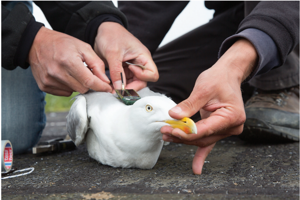
Figure 3. Researchers equipping a Herring Gull with a UvA-BiTS GPS tracker on the roof of the Vismijn in Ostend on May 24, 2013.

built-in tri-axial accelerometer as well. The system allows us to remotely set or change a measurement interval per tracker: the actual interval between measurements is provided in samplingEffort as secondsSinceLastOccurrence .