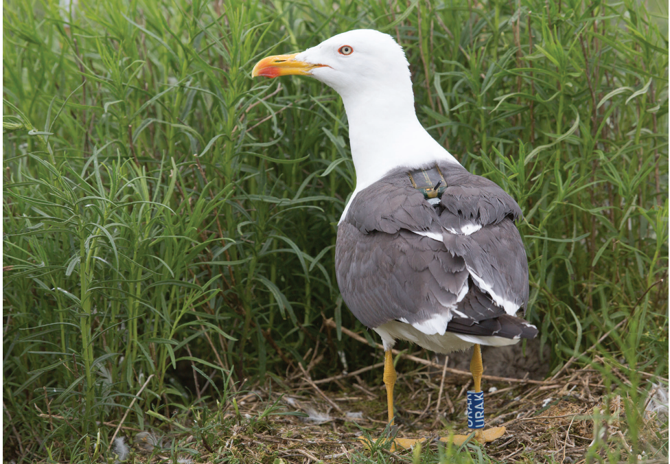
Figure 1. One of the tracked Lesser Black-backed Gulls (“Hans”, ring code: L906682), photographed near its nest in Zeebrugge on May 29, 2013 shortly after he was equipped with a tracker (device info serial: 861).