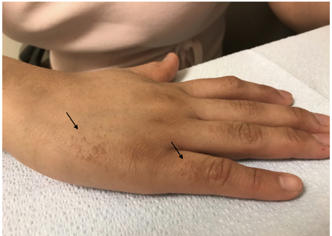
FIGURE 2: Light brown, monomorphic ovoid papules symmetrically distributed on the interphalangeal skin (right arrow) and lateral right hand (left arrow)