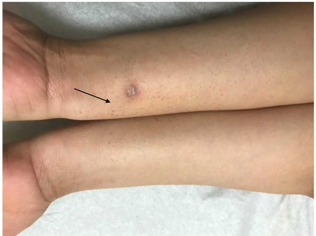
FIGURE 3: Light brown ovoid papules (arrow) symmetrically