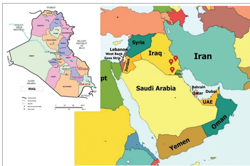
Figure-1: Locations of the study performed on buffaloes in marshes of the south of Iraq.

*Refers to significant variation at p \leq 0.05