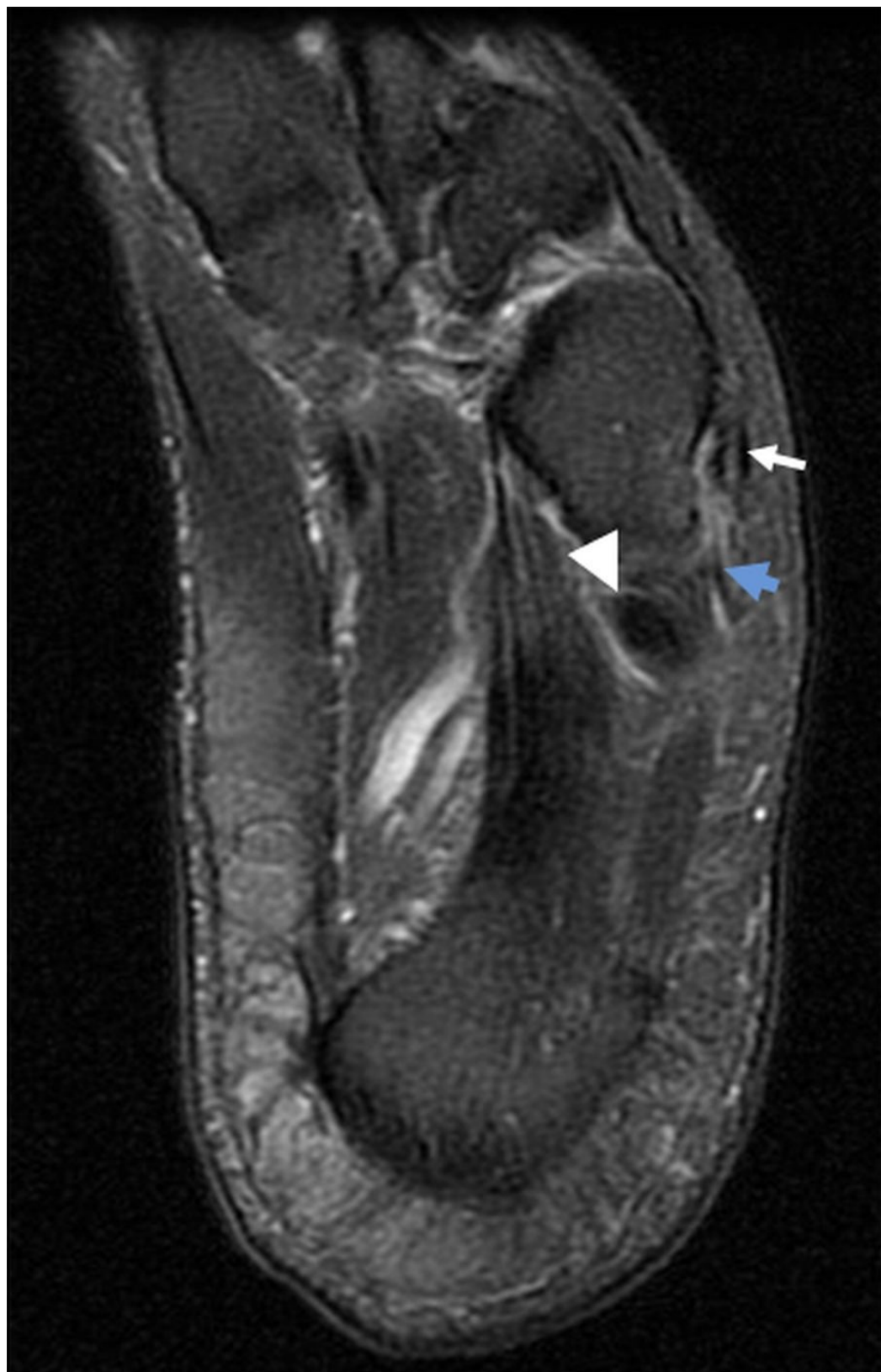
FIGURE 1: Longitudinal Split Tears of the Peroneus Tertius, Longus and Brevis Tendons

T2 prolongation along the peroneus tertius tendon sheath is present, with a short segment longitudinal split tear immediately adjacent to its insertion at this level (white arrow). There is an additional high-grade longitudinal split tear of the peroneus longus tendon (arrowhead). A complex longitudinal split tear of the peroneus brevis tendon was also present, with non-