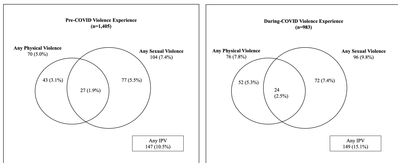
Figure 1 Venn diagram of types of violence experienced during pregnancy, by pre-exposure/post-exposure.

SNNP, Southern Nations, Nationalities, and People's Region.