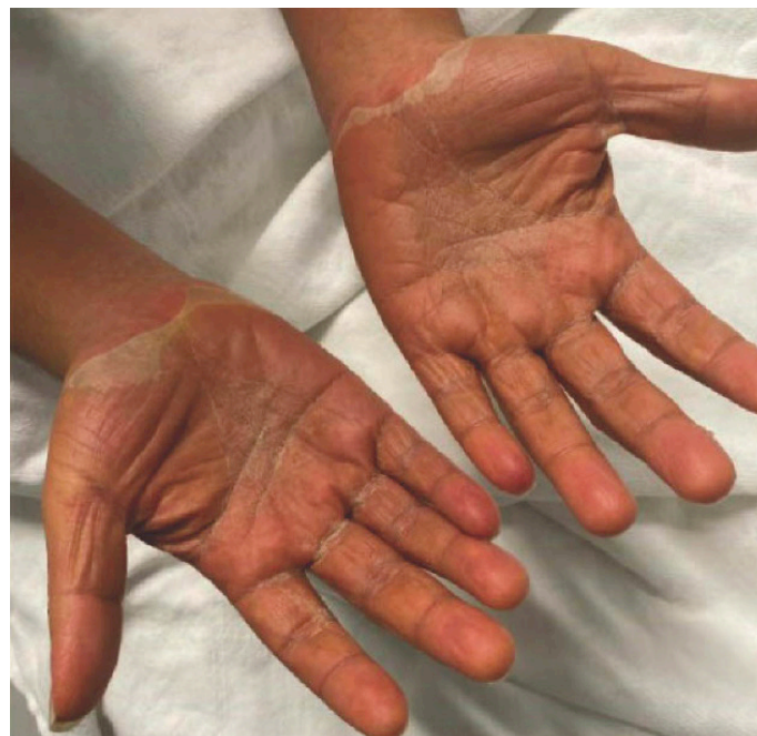
Figure 1. Desquamating rash of palms on day 2 of presentation.

Allopurinol is a xanthine oxidase inhibitor used for long-term gout management, and its metabolite, oxypurinol, is known to trigger a cytotoxic T-cell response and is thought to be the cause of allopurinol-mediated hypersensitivity. [11] Chronic allopurinol therapy for gout has been associated with transient liver enzyme abnormalities in 2–6%