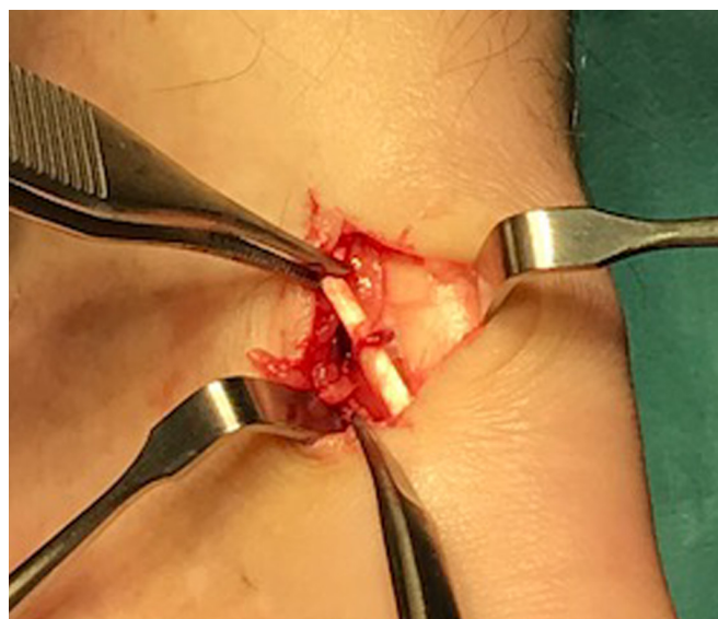
Figure 2 Surgical exploration in local anaesthesia via a 1 cm long skin incision on the medial side of the Achilles tendon mid-portion in a patient with plantaris tendinopathy. The plantaris tendon is seen embedded in vascularised fat tissue on the medial side of the Achilles (A). Extirpation of 5–6 cm of the plantaris tendon and adjacent fat tissue.

Examination via US+colour Doppler showed a normal Achilles tendon (figure 1A). No thickening, no hypoechogenicity and no high blood flow were detected.