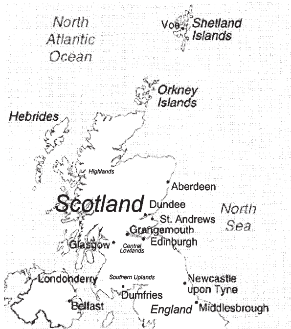
Figure 3 Map of Scotland. The BRCA1 2800delAA families likely originated from the Central Lowlands and Southern Uplands of Scotland. The BRCA1 2800delAA families were identified through regional genetics clinics in the West Central region of Scotland (Glasgow, Edinburgh, Dundee and St Andrews). One Toronto family (UT271) originated from the county of Kirkcubrightshire (near Dumfries). To date, the 2800delAA mutation has not been identified in families from the Aberdeen catchment area of the North East (Haite, personal communication). Map was modified from Virtual Tourist web-site: http://www.vtourist.com/Europe/United_Kingdom/ciafacts

haplotype analysis for key individuals belonging to families with the BRCA1 2800delAA mutation showed that the 17 mutation-positive families share the same BRCA1 -linked haplotype. Specifically, the ten BRCA1 2800delAA families from North America were found to share the Scottish BRCA1 haplotype. These included five families with reported Scottish ancestry and four families where the index case reported 'British' ancestry when less certain of the geographic origin of their family beyond the British isles or 'Anglo-Saxon' ethnicity (Table 2). The shared haplotype found between these families and the Scottish 2800delAA families supports a common ancestral origin.