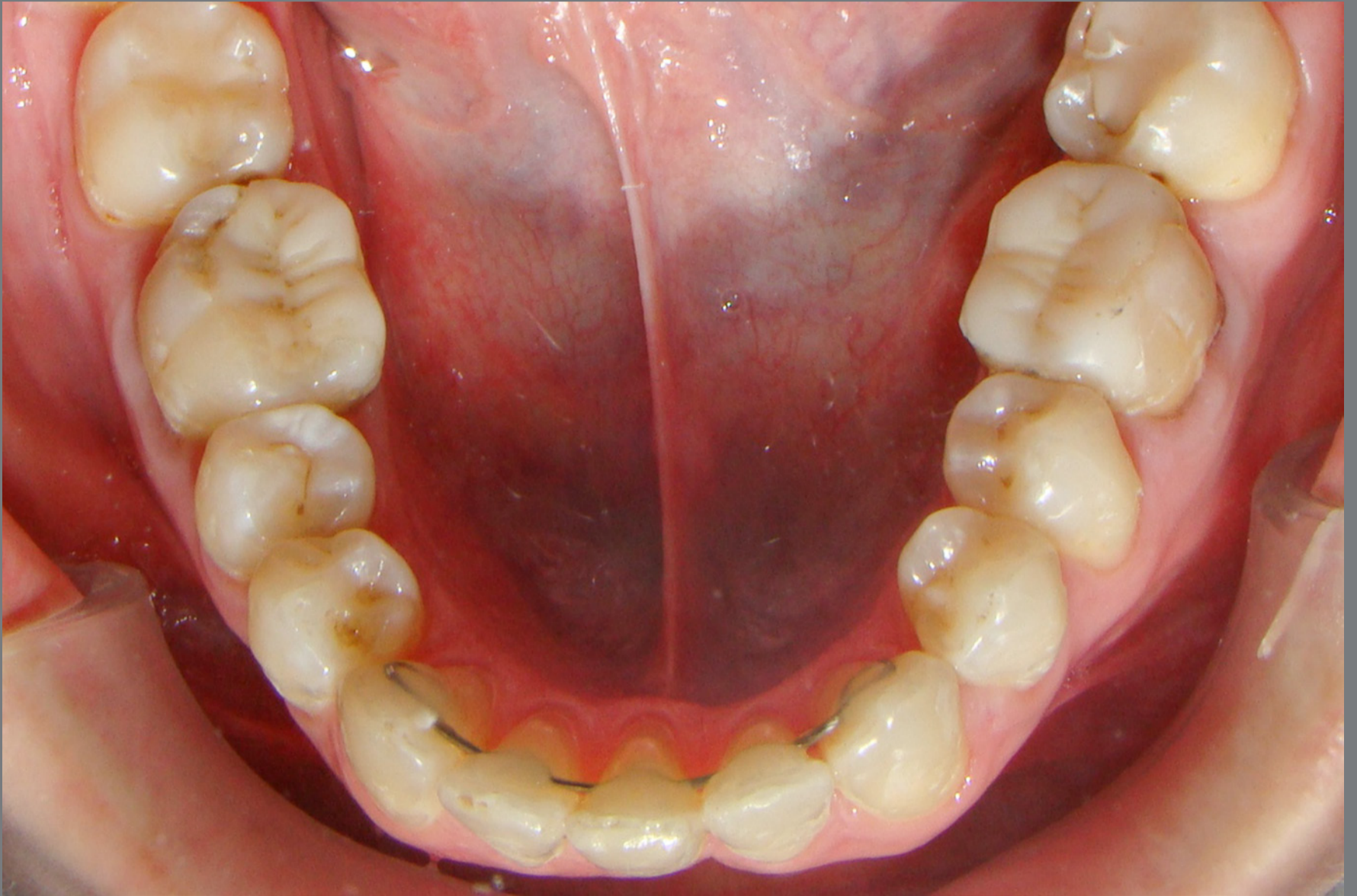
Figure 1: Fixed retainer.

At 1 year posttreatment follow-up, all patients still had the 3x3 bonded mandibular retainer in place. This information was obtained from the patients' records. In the last follow-up recall ( T_3 ), some patients still had the 3x3 bonded mandibular retainer in place and some, due to personal reasons, did not. Thus, the sample was divided into two groups, according to