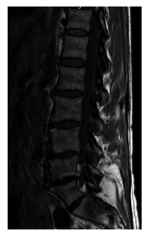
FIGURE 2 MRI lumbar spine exhibiting vertebral mass extending from L4 to S1 with compression of the lumbosacral nerve roots