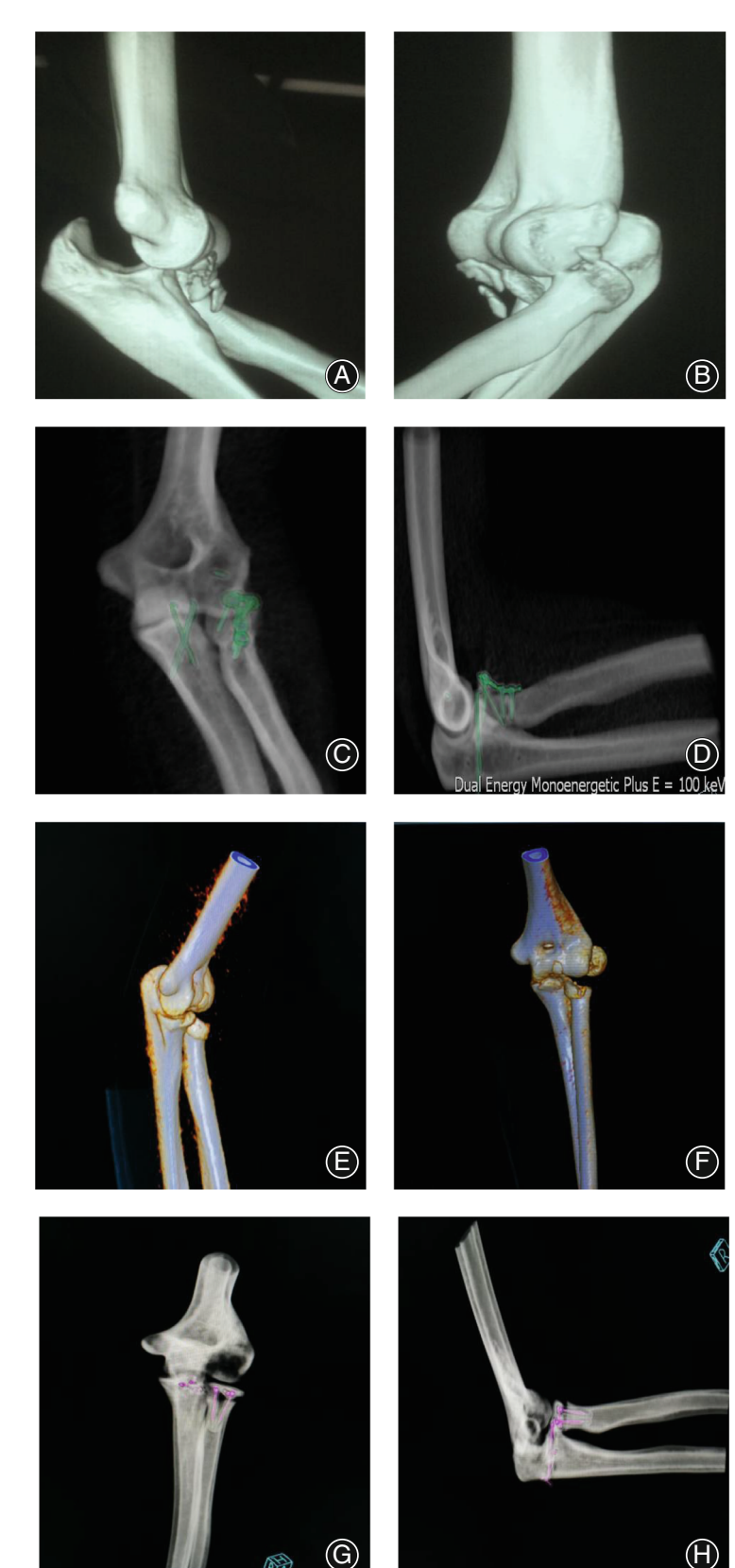
FIGURE 3 Computed tomography images. (A, B) Preoperative computed tomography showed the No.1 patient with the terrible triad of the right elbow; (E, F) Preoperative computed tomography showed the No.2 patient with the terrible triad of the left elbow. (C, D) Postoperative computed tomography showed that the fracture of No.1 patient was well restored, and the joint was stable. (G, H) Postoperative computed tomography showed that the fracture of No.2 patient was also well restored, and the joint was also stable

SINGLE MODIFIED POSTERIOR APPROACH FOR TERRIBLE TRIAD INJURY