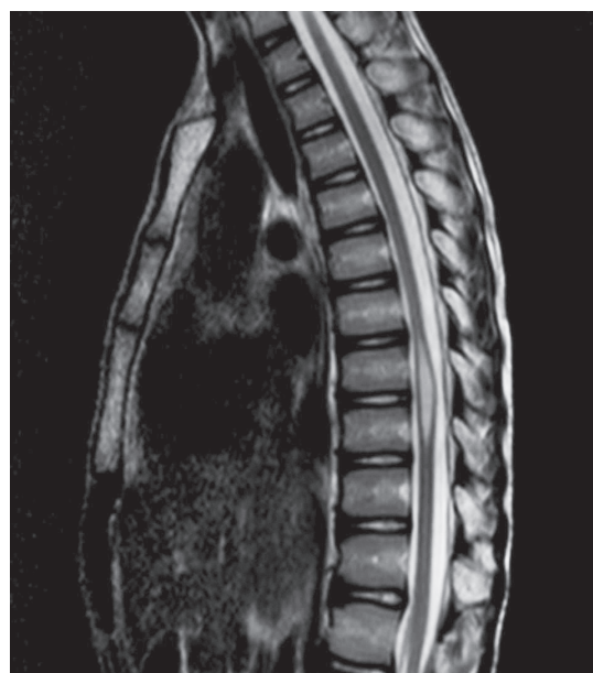
Fig. 1. Syringomyelia in the thoracic region.

None of the seven patients with ISPs required addi-