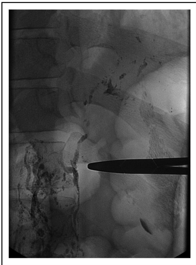
Figure 2. A frank extensive leak detected at the level of T10, showing a severely lacerated thoracic duct freely spilling contrast into the LUQ abdomen.

The thoracic duct is the largest lymphatic channel within the body. Except for the right head, neck, upper extremity, and chest, this channel is responsible for the remainder of lymphatic drainage. Flow starts at the cisterna chyli within the abdomen, acting as a confluence point for other smaller lymphatics coming from the lumbar, intestinal, liver, and inferior intercostal sources, located between the abdominal aorta and azygous vein. It courses posterior to the right crus of the diaphragm and along the right posterior mediastinum with a final destination proximal to the junction between the left subclavian and internal jugular veins. 2,3 The true presence of a cisterna chyli was found in only 50% of individuals and in those missing this anatomic confluence are replaced by smaller lymphatic channels of the abdomen and lower extremities that form directly into the thoracic duct. 8