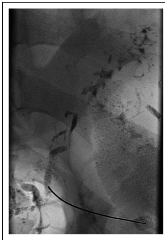
Figure 3. Fluoroscopic imaging displaying transabdominal puncture of the thoracic duct followed by contrast and lymphatic glue injection.

The anatomic course of the thoracic duct in relation to the esophagus dictates that this complication should rarely