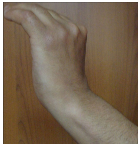
Figure 3: Shows early postoperative result

axons over long segments of nerve are disrupted and in cases of causing by severe blows, axons are disrupted only at the site of impact. [8] Stretch injuries can be induced by traction as well. Displacement of fractures and dislocated joints can occur by stretch injury to peripheral nerves. Stretch injuries may result in during operative or other surgical procedures. [6,7]