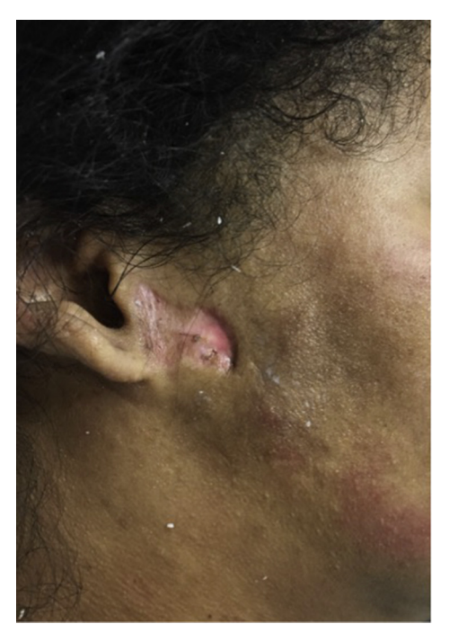
Fig 1. Right preauricular, subcutaneous, firm plaque with overlying atrophic depression and erythema.

weeks before admission, the patient was on vacation for 1.5 weeks, spending a significant amount of time in the sun. On presentation, she reported 1 week of headaches, back pain, and worsening rash on the face and upper extremities. Laboratory values were notable for decreased C3 (63 mg/dL)/C4 (9.0 mg/dL) complement and elevated double-stranded DNA IgG antibodies (102.7 IU/mL), supportive of an acute SLE flare. The dermatology department was consulted for evaluation of rock hard bilateral preauricular plaques.