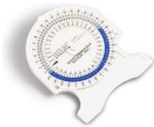
Fig. 1 Inclinometer