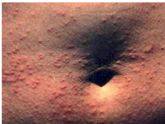
Figure 4 7 days after the exposure to the stings.

Overall, 78.7% of the fishermen gave a history of jellyfish stings during the three months preceding the interview. There was no significant difference between the three stations (Table 1). The common sites of stings were the hands and arms (65.4%) followed by the legs (29.9%). Other parts of the body were also attacked, such as the abdomen, eyes and back (Table 2). Most fishermen (95.2%) claimed that stinging led to skin reactions within 5 minutes. The presenting complaints were pain (89%), itching (68%), burning sensation (45%), and erythematous wheals (90.5%) (Figure 2). Fainting was reported by 3% of the fishermen. About three days after the sting, painless but itchy erythematous monomorphic papular rashes (Figures 3 and 4) developed at the sites of the stings in 62% of the fishermen as a delayed type of skin reaction that resolved spontaneously in most cases (Table 3).