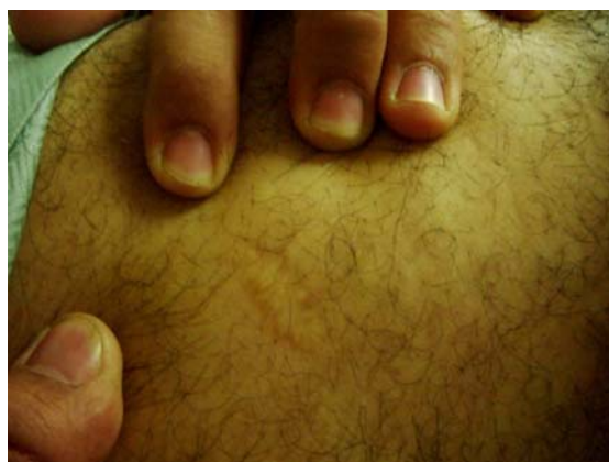
Figure 2 12 hours after the exposure to jelly

The type of jellyfish common in Basra is white Jellyfish ( Rhizostoma sp) (Figure 1). It has a white translucent umbrella and eight oral arms. Its common local names are Thaklol, Zaklol, and White jellyfish [14]. Because no study has been carried out in the Basra region, we investigated the clinical presentations and managements of jellyfish stings in this area.