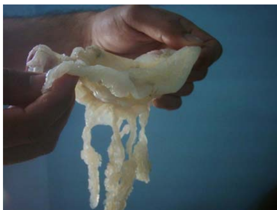
Figure 1 Rhizostoma species

Venomous marine creatures are a well-recognized hazard for those working and swimming in the tropical Pacific Ocean. The incidence of envenomation from marine creatures' bites and stings appears to be rising due to increasing marine activities of local populations and tourists [1,2], and those who are involved in water activities such as swimming, sailing, and saltwater fishing, are more likely to get stung. Fortunately, most jellyfish stings are not severe. Immediate skin reactions include local erythema, pain, pruritus, parasthesias, blistering, and swelling [3,4]. Delayed skin reactions may occur within few days and mainly present as pruritic papules [5, 6] with histological findings similar to those of allergic contact dermatitis [7]. Systemic reactions are usually associated with exposure to a large amount of the toxin and are usually limited to nausea, headache, and chills but may lead to a major anaphylactic reaction [8-10].