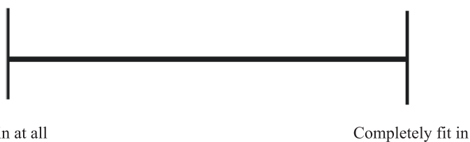
Fig. 3 Visual analogue scales

Do you feel that you fit in right now, a mark on the line to the left represents do not fit in at all, towards the right, completely fit in.