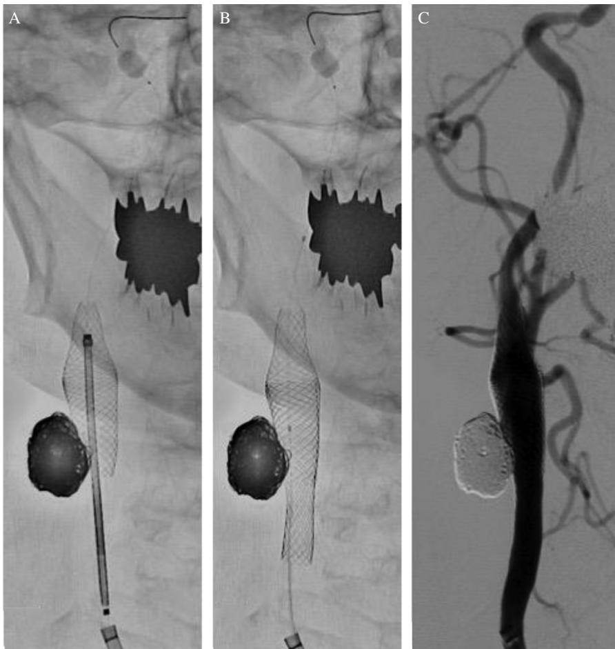
Fig. 3 (A and B) The first Wall stent was shortened to the center of the neck of the aneurysm. The Wall 10 × 24-mm carotid stent was placed from the carotid bulb. The second stent was placed to overlap the first stent by 2.5 cm (C) common carotid artery angiogram after treatment. Recanalization of the pseudoaneurysm was not observed.