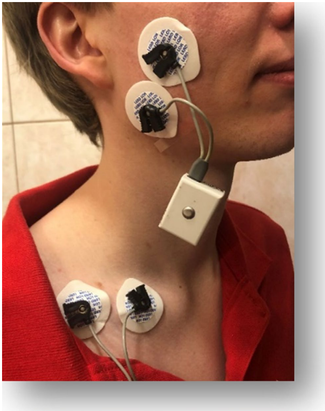
FIGURE 1 Electrodes placement during the electromyographical procedure

The EMG-measured median values of masseters' tone in physiotherapy students were as follows: 66.4 \mu V (64.4 \div 68.5 \mu V) for right muscle (RM) and 67.9 \mu V (65.5 \div 70.0 \mu V) for left (LM). In dentistry students, these values for both of the muscles were as follows: 64.8 \mu V (RM 63.1 \div 66.6; LM 63.4 \div 66.7 \mu V) (Table 5).