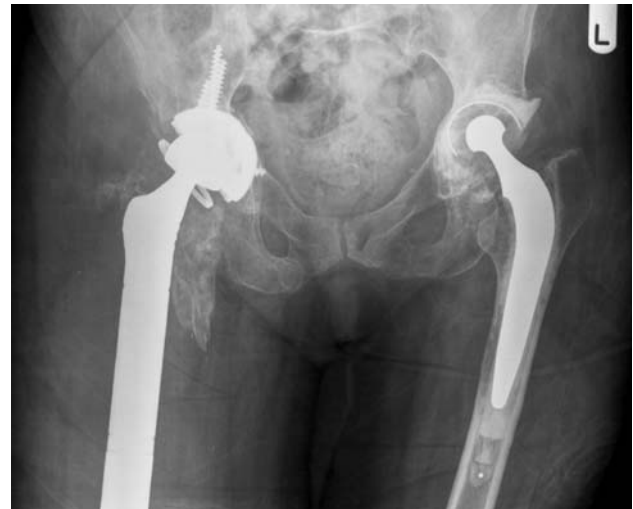
Fig. 5 Postoperative direct exchange right total femoral replacement for patient in Fig. 3, showing proximal prosthesis

chronic draining sinus in the knee (patient C). Two patients (patients B and C) had previously had extensive surgeries in the whole femur, which again failed secondary to sepsis. Subsequently, these two patients were treated with a total femoral replacement.