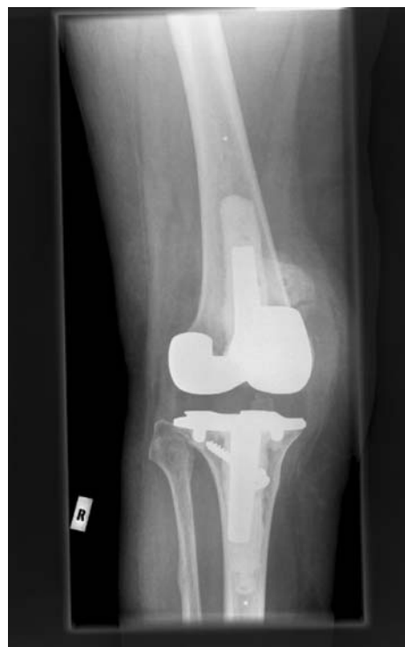
Fig. 1 Preoperatively infected right revision knee replacement with osteolysis

Between March 2003 and December 2007, six direct exchange arthroplasty procedures (four distal femoral replacements and two total femoral replacements) with tumour prostheses were performed for chronic periprosthetic knee infections associated with severe bone loss (Figs. 1, 2, 3, 4, 5, 6) [3]. This was a retrospective review of prospectively collected data. Chronic infection was defined as persistent infection greater than 1 month from the index operation. Four patients (patients A, D, E and F) had infected knee prostheses (and underwent distal femoral replacements) and two patients (patients B and C) had combined infected hip and knee prostheses (Table 1). These two patients underwent total femoral replacements. All patients were managed in collaboration with the infectious diseases department at our institution. The cohort had one male and five female patients. At clinical presentation, all patients were wheelchair-bound secondary to pain and instability. Radiographs revealed a failing