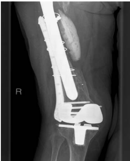
Fig. 4 Preoperatively infected metalwork right femur with osteolysis showing distal femur for the patient in Fig. 3

chronic draining sinus in the knee (patient C). Two patients (patients B and C) had previously had extensive surgeries in the whole femur, which again failed secondary to sepsis. Subsequently, these two patients were treated with a total femoral replacement.