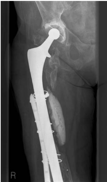
Fig. 3 Preoperatively infected metalwork right femur with osteolysis, showing proximal femur