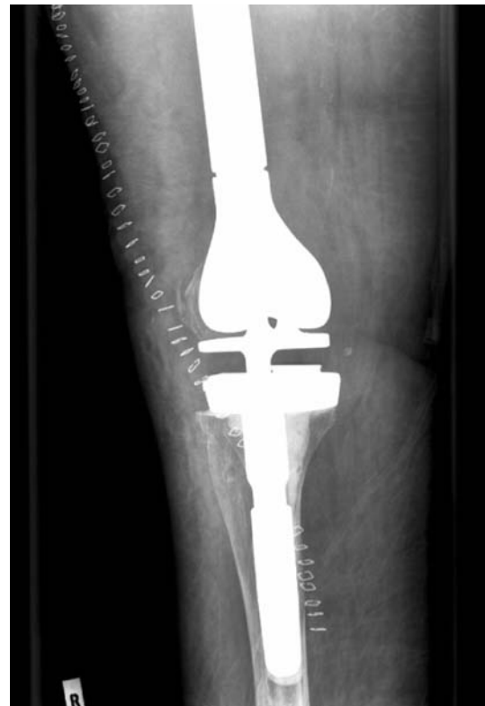
Fig. 6 Postoperative direct exchange right total femoral replacement for patient in Fig. 3, showing distal prosthesis

The presence of infection was confirmed by a positive culture of joint aspirate or by intraoperative culture, or both, in addition to inflammatory changes [18]. Infection was diagnosed microbiologically when more than one tissue culture revealed similar organisms. Pre- and postoperative pain and functional assessments were assessed using the Oxford knee scoring system.