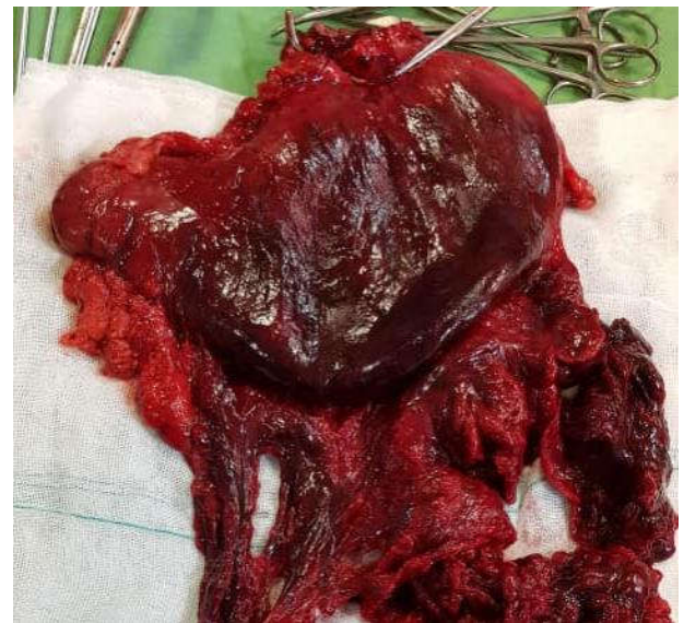
Figure 4. Total gastrectomy of strangulated stomach which shows a complete gangrene of the stomach.

These injuries are driven to be repaired by surgical intervention to prevent a catastrophic herniation of abdominal organs and viscera to the thorax. If these injuries are left untreated, they would be presented with one of the most overwhelming complications of herniation which is called strangulated diaphragmatic hernia. This phenomenon is fatal and prompts an urgent surgery (2).