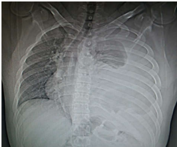
Figure 2. chest x ray