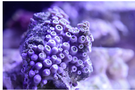
Fig. 1. Photograph of zoanthid (Green Bay Packers) coral from the patient's aquarium. Individual purple polyps are seen growing together in a colony.