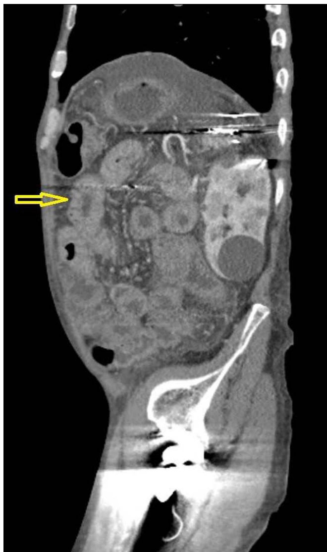
Figure 1. Sagittal view of computed tomography enterography showing diffuse circumferential wall thickening of small bowel loops with the segmental thickening of large bowel and rectum suggestive of diffuse enterocolitis. Arrow points to an area of the thickened small bowel.

biopsy revealed partial villous blunting and epithelial reactive changes (Figures 2 and 3). There are rare foci of crypt epithelial apoptosis and paucity of plasma cells within the lamina propria. No evidence of CMV inclusion was identified in hematoxylin and eosin-stained slides and CMV immunohistochemistry. Before the initiation of steroids, the patient had not been taking nonsteroidal anti-inflammatory drugs, chemotherapy, or other medications commonly associated with enteropathy. Therapy with budesonide and intravenous (IV) corticosteroids did not affect his severe symptoms, and total parenteral nutrition was initiated.