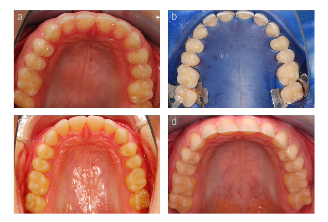
Figure 3. Example of a case (occlusal view of upper jaw) of the second cohort. ( a ) Baseline situation; ( b ) clinical situation at the reconstructive appointment before treatment, and ( c ) after the composite vertical bite reconstruction; ( d ) clinical situation at the 5-year follow-up.