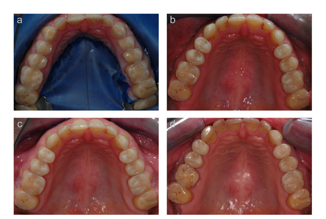
Figure 2. Example of a case (occlusal view of upper jaw) of the first cohort. ( a ) Clinical situation at the reconstructive appointment before treatment; ( b ) clinical situation at the 2 year, ( c ) 5-year, and ( d ) 10-year follow-up.

At the 10.7-year follow-up, none of the restorations showed secondary caries, and all teeth were therefore rated 'Alpha'. Likewise, none of the teeth showed any signs of hypersensitivity when provoked with air (100% 'Alpha' ratings). Highly predominant 'Alpha' ratings of the restorations were also given for the items color stability (96%), marginal inflammation (86%), and color match (77%). Marginal integrity was rated 'Alpha' in 55% and 'Bravo' in 43% of the restorations. One restoration showed a negative step (2%). Since the negative step was not removable with finishing, this restoration was rated 'Charlie'. One restoration from the same patient showed localized, non-removable discoloration in the marginal area, which was rated 'Charlie' (2%). The other restorations received 'Alpha' (57%) and 'Bravo' (41%) ratings in terms of marginal discoloration. The item anatomical form was predominantly rated 'Bravo' (57%), due to visible loss of composite material as a result of attrition. Three restorations (5%) showed small composite defects extending to the tooth surface and were therefore rated 'Charlie'. For 38% of the restorations the anatomic form was rated 'Alpha'. 'Alpha' (52%) and 'Bravo' (48%) ratings were about equally present for the item surface texture.