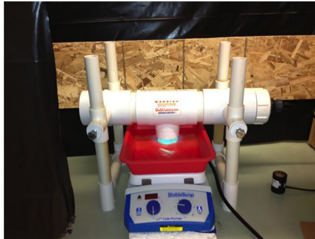
Fig 1. Laboratory setup. UV-C lamp set up as collimated beam. Data logging radiometer seen below lamp.