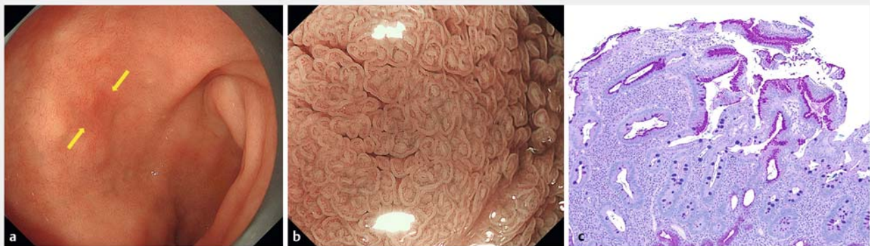
► Fig. 2 Endoscopic and histopathological findings of the duodenum with mucosal lesions. a Conventional white-light imaging. Red flat lesions are observed in the duodenal bulb (arrow). b Magnifying endoscopy with narrow-band imaging at the same site. The villous structure is disappeared, and the marginal crypt epithelium appears curved shape. c Histopathological findings of the same site. Alcian blue-periodic acid Schiff staining; the mucosal epithelium replaced with the gastric crypt epithelium is stained reddish-purple.