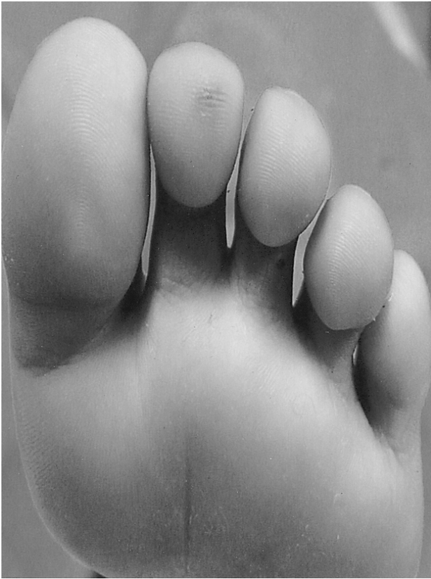
Figure 1. A tiny bluish subcutaneous nodule is seen on the toe of the left foot.

At the outpatient clinic before admission, she had appeared pale with anemic conjunctivae; she had a blood pressure of 90/60 mmHg, a heart rate of 70/min and a body temperature of 36°C. There were no skeletal deformities. A digital rectal examination showed negative results. According to the laboratory examinations performed at the outpatient clinic, her hemoglobin was 5.9 g/dL and her hematocrit was 22.7%. In response to these values, we administered iron replacement therapy and transfusion of packed red cell at an outpatient clinic. After hospitalization, the hemoglobin was 13.2 g/dL, the hematocrit 38.6%, the white blood cell count was 7,700/mm 3 and the platelet count was 322,000/mm 3 . The serum blood urea nitrogen was 8.9 mg/dL, the creatinine 0.57 mg/dL, AST 17 IU/L, ALT 14 IU/L, sodium 138 mEq/L, potassium 3.8 mEq/L and chloride 104 mEq/L. The serum iron was 7 µg/dL, the ferritin was 2.2 µg/dL and the TIBC was 379 µg/dL. A fecal occult blood test was positive. The chest X-ray and abdomen computed tomography were all negative for any abnormalities. In order to detect the cause of her iron deficiency anemia, we performed endoscopy, a small bowel series and colonoscopy. Endoscopy showed seven polyp-like mass lesions with abundant vasculature at the greater curvature of the body and fundus, the posterior wall of