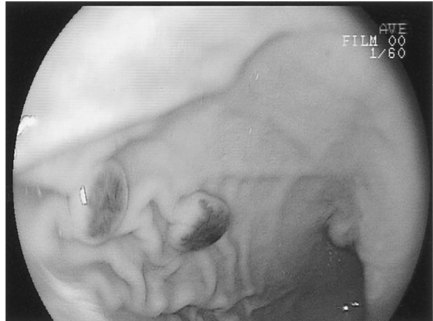
Figure 2. Endoscopy shows multiple polypoid mucosal nodules with abundant vasculature, and these nodules are centrally located at the greater curvature of the stomach's body and fundus, the posterior wall of the gastro-esophageal junction and the anterior wall of the gastric angle.

At the outpatient clinic before admission, she had appeared pale with anemic conjunctivae; she had a blood pressure of 90/60 mmHg, a heart rate of 70/min and a body temperature of 36°C. There were no skeletal deformities. A digital rectal examination showed negative results. According to the laboratory examinations performed at the outpatient clinic, her hemoglobin was 5.9 g/dL and her hematocrit was 22.7%. In response to these values, we administered iron replacement therapy and transfusion of packed red cell at an outpatient clinic. After hospitalization, the hemoglobin was 13.2 g/dL, the hematocrit 38.6%, the white blood cell count was 7,700/mm 3 and the platelet count was 322,000/mm 3 . The serum blood urea nitrogen was 8.9 mg/dL, the creatinine 0.57 mg/dL, AST 17 IU/L, ALT 14 IU/L, sodium 138 mEq/L, potassium 3.8 mEq/L and chloride 104 mEq/L. The serum iron was 7 µg/dL, the ferritin was 2.2 µg/dL and the TIBC was 379 µg/dL. A fecal occult blood test was positive. The chest X-ray and abdomen computed tomography were all negative for any abnormalities. In order to detect the cause of her iron deficiency anemia, we performed endoscopy, a small bowel series and colonoscopy. Endoscopy showed seven polyp-like mass lesions with abundant vasculature at the greater curvature of the body and fundus, the posterior wall of