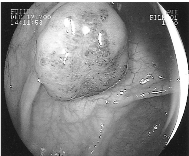
Figure 5. Colonoscopy shows eight multiple polypoid mass lesions with abundant vasculature and these lesions are centrally located from the ascending colon to the rectum.

there were no recurrent episodes of epistaxis, no family history of any recurrent skin lesions or gastrointestinal bleeding, and her physical examination showed no skeletal deformity. On the 7 th day after hospitalization, the patient's hemoglobin and hematocrit had decreased slightly to 12.1 mg/dL and 35.7%, respectively. However, melena or hematochezia was not noted. Methylprednisolone (2 mg/kg/day) was given orally starting at the 8 th day of hospitalization, and there was no decrease in the hemoglobin and hematocrit values until the 17 th day. On the other hand, a follow-up endoscopy performed on the 21 st day showed no changes in size or number of the multiple polypoid