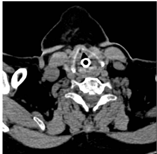
Figure 2. CT with tube: CT scan of the neck during tracheal tube placement showed obvious edema of the soft tissue around the glottis. CT = computerized tomography.