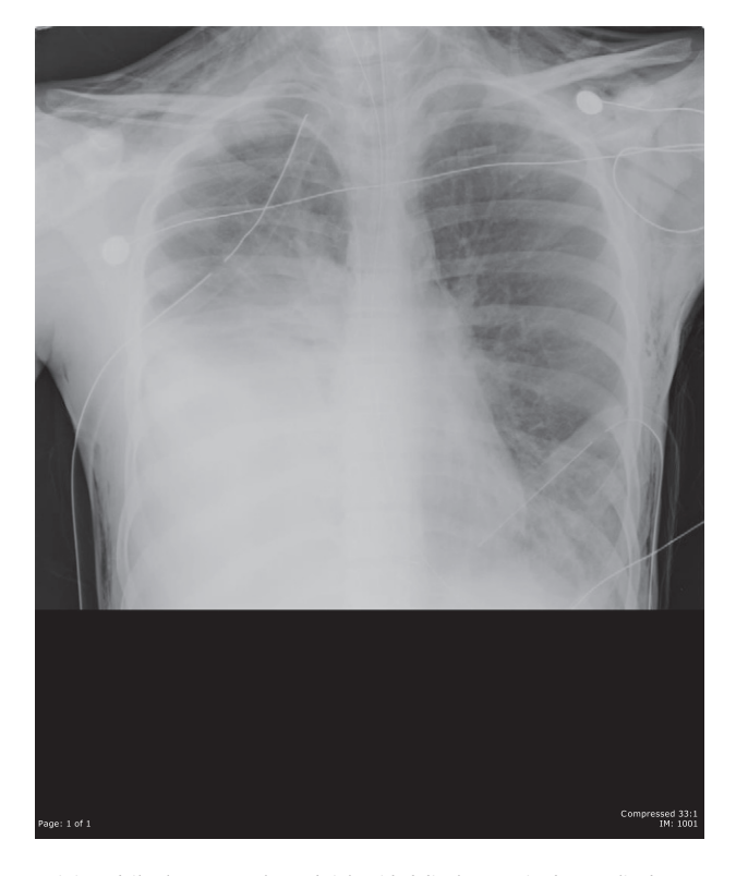
Fig. 1. The post-injury daily chest X-ray showed right-sided diaphragmatic abnormality but was nonspecific.

complex pelvic fractures; spleen, liver, and renal injuries; and left diaphragmatic rupture. His initial chest X-ray (CXR) revealed his stomach herniating inside his left chest. He underwent immediate laparotomy and repair of his left diaphragm. Intraoperatively, the surgeon examined the right diaphragm by palpation and noted no abnormality. Postoperatively, the patient had a prolonged ventilator-dependence. His daily CXR showed right-sided diaphragmatic abnormality (Fig. 1) but was nonspecific. We performed a dynamic ultrasound to evaluate the right diaphragm; the result suggested that the right diaphragm was paralysed, probably secondary to right phrenic nerve injury. On 3 occasions (post-injury day 0, 4, and 15), the patient underwent CT of the chest; none of those 3 scans reported right-sided diaphragmatic injury, despite the presence of