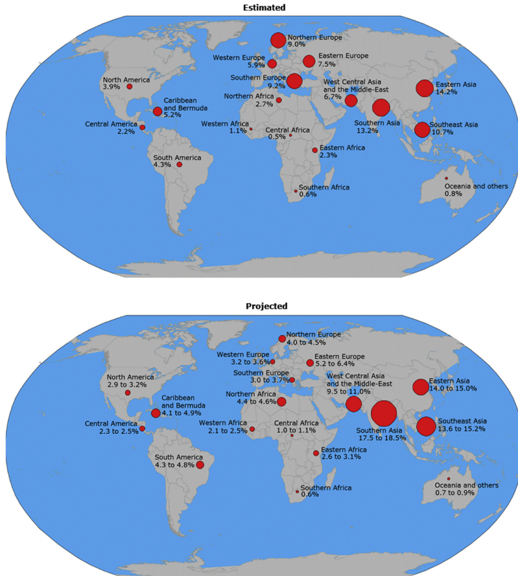
Figure 3. Distribution (in percent) of immigrants to Canada by place birth, 2011 (estimated) and 2036 (projected). The size of the circles is proportional to the distribution of immigrants by birthplace (from Statistics Canada 2016). Reproduced with permission of Statistics Canada.

hypertension) that confers increased risk for ASCVD and is more prevalent in SAs. 1 The prevalence of metabolic syndrome is increasing among SAs residing on the Indian subcontinent, and in SA migrant communities, it is estimated that 20% to 25% of SAs currently have metabolic syndrome. 25 It has been hypothesized that excess body fat and adverse body fat patterning found in SAs (even at a normal BMI) may contribute to the high prevalence of insulin resistance, which is the underpinnings of diabetes and early atherosclerosis. 26