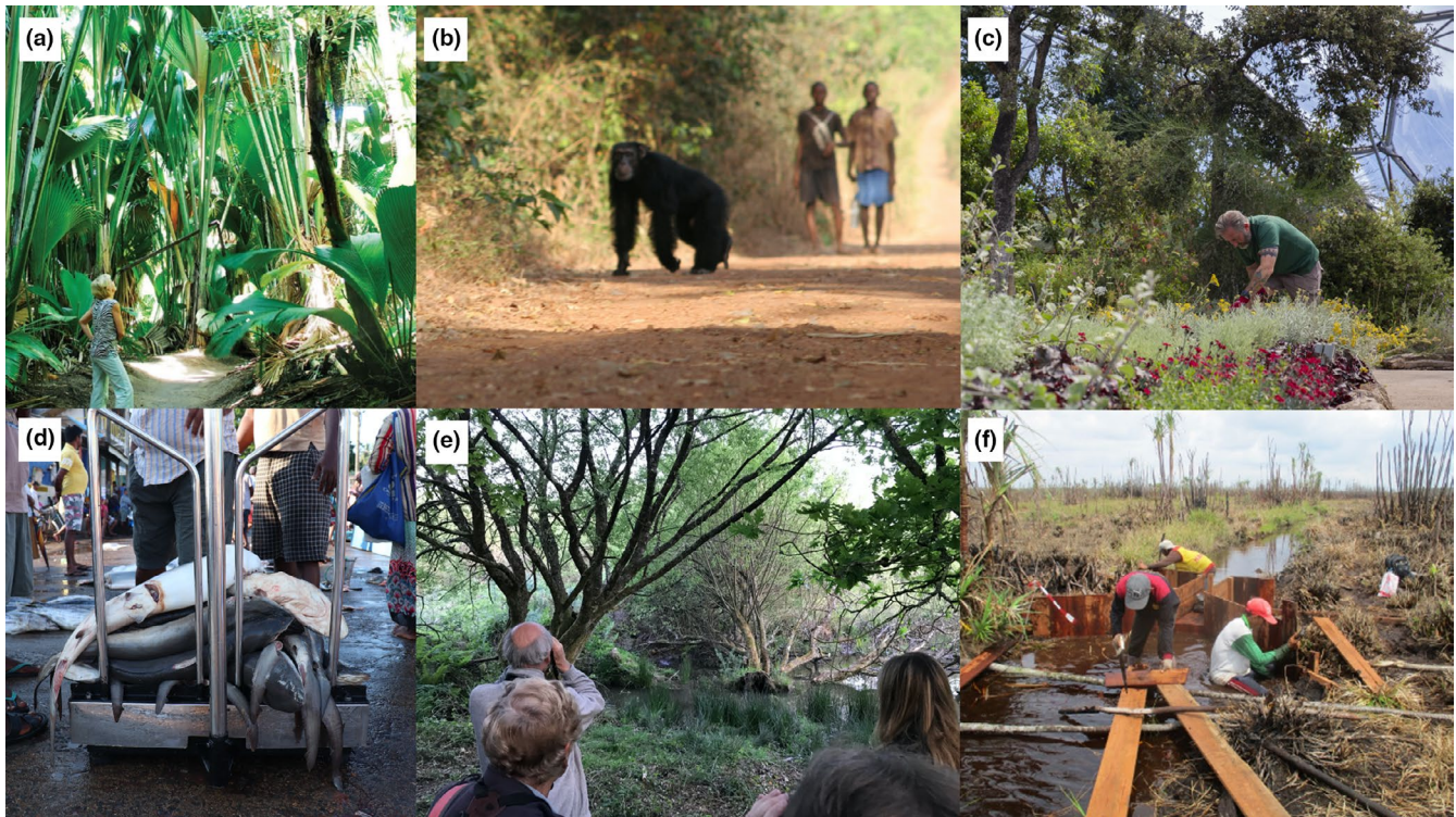
FIGURE 1 A conservation issue highlighted or driven by the COVID-19 pandemic, by case study site. (a) In the Seychelles, international tourism temporarily ceased, meaning a complete loss of funds for many protected areas, including the UNESCO World Heritage site of the Vallée de Mai. (b) Chimpanzees and other wildlife may also be susceptible to the novel coronavirus, creating a possibility of inter-species transmission especially in shared landscapes such as Cantanhez National Park, Guinea-Bissau. (c) The Eden Project, UK, was closed to visitors for 75 days, with estimated revenue losses of up to 5 million GBP. (d) In Sri Lanka, sellers were quick to adapt to lockdown measures, but fishers, small-scale traders and casual workers appear to have been the most impacted by the market changes resulting from the pandemic. (e) The Cornwall Wildlife Trust, UK, raises funds from community engagement events such as this public beaver walk, many of which were unable to occur in 2020. (f) In Indonesian Borneo, conservation actions such as habitat restoration (in this case, the damming of old illegal logging canals in the peat) have been able to largely continue because the work is managed and carried out by small local teams. Where individuals are identifiable, consent has been gained for the use of their photograph for publication

et al., 2012). Some of the most extreme examples involved the wide-scale destruction of highly diverse habitats via the drainage of wetlands (Olival et al., 2012; Richardson & Hussain, 2006), defoliation of forests (Nguyen, 2009) and the dumping of pollutants into aquatic environments (Lawrence et al., 2015). In such cases, habitats and their associated biodiversity take decades to recover, if they recover at all. Less extreme, but still significant, is the fragmentation and transformation of natural habitats into plantations or farmlands via the migration and settlement of populations displaced by conflict, or the incursion of roads and infrastructure by military or guerrilla groups (Butsic et al., 2015). Once conflict has subsided, the fragmentation of habitats and incursion of infrastructure often makes previously remote areas more accessible, opening up natural resource extraction opportunities and encouraging settlement of previously abandoned or remote areas (Dávalos, 2001; Clerici et al., 2020; Conteh et al., 2017; Enaruvbe et al., 2019; Grima & Singh, 2019).