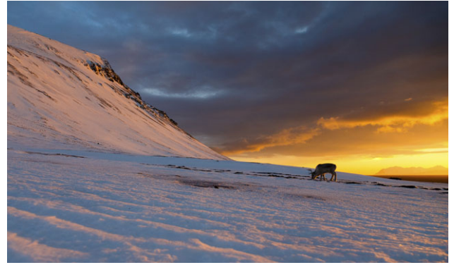
Figure 2. A reindeer forages on terricolous lichens at the onset of twilight in Svalbard, Norway. Reindeer visual systems appear well suited for detecting patches of UV-absorbing lichens on snowy landscapes [6].

To explore this idea, they developed a physical model of the two-dimensional photonic crystal structure. When intraocular pressures are low during summer months, their model predicts fluid infilling between fibrils and thus wider inter-fibril distances; but when intraocular pressures are high during the winter months, some of the fluid between fibrils is expelled, resulting in a compacted hexagonal array of fibrils. Changes in fibril spacing predict changes in \lambda_{\max} , which they tested by slowly evaporating fluid from summer and winter tapetum surfaces while monitoring changes in the reflectance spectrum. This experiment