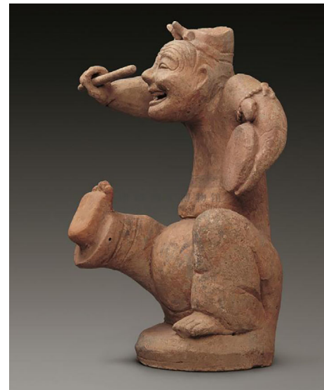
FIGURE 3 The sculpture, “Pottery Story-teller Beating a Drum,” is 56 cm tall, and part of the collection at the National Museum of China, Beijing, China ( http://www.chnmuseum.cn/zp/zpml/201812/t20181218_25869.shtml )

Another pottery figure “Eastern Han Story-teller” (Figure 4) is part of a collection at the Sichuan Museum in China ( http://www.scmuseum.cn/thread-271-117.html ). The story-teller figure has a normal-shaped head and short proximal limbs, with a similar posture of drum-beating. However, he grimaces and sticks out his tongue as if he is trying to make his story more dramatic. These sculptures portray the artistic images of dwarf story-tellers through exaggerated and humorous facial expression and gesture, revealing their vivid performance skill (Wang, 1987).