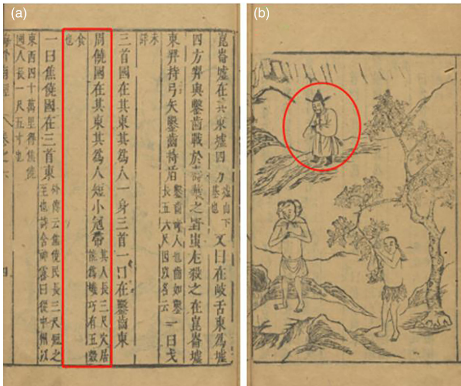
FIGURE 2 The red box marked in “(a)” is the sentence in the page 151 of chapter entitled “the Classic of Regions beyond the Seas: the South” from the same book as Figure 1 which describes the “dwarf state” of Zhou Yao in Chinese ( https://iif.harvard.edu/manifests/view/drs:53915097$151i ). The red circle marked in “(b)” is the drawing of a dwarf wearing a hat and belt in the state of Zhou Yao, which is in the same book ( https://iif.harvard.edu/manifests/view/drs:53915097$152i )

singers and story-tellers in ancient China (Wang, 1957; Yin, 2004), and their figures were frequently captured in Chinese sculptures. One of the most famous sculptures depicting a court entertainer with probable dwarfism is “Story-teller Beating a Drum” ( http://www.chnmuseum.cn/zp/zpml/201812/t20181218_25869.shtml ), a ceramic figure excavated from in a tomb which can be traced back to the Eastern Han Dynasty (25 AD–220 AD) (Liu, 1958). Figure 3 shows the story-teller wearing a headband with ornamental design on his forehead, and naked to the waist with bare feet. He appears to have disproportionately short arms and legs, suggesting a skeletal dysplasia, possibly achondroplasia, although he seems to lack a large head (macrocephaly). He waves a drumstick in his right hand, and beats the drum held by his left hand; the short limbs are outstretched. He looks happy with his mouth widely open. Pottery figures like this one were mass produced in the Han Dynasty (Rawson, 2001).