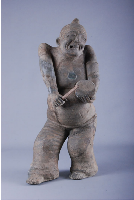
FIGURE 4 The pottery sculpture entitled “Eastern Han Story-teller” measures 66.5 cm and is part of a collection at the Sichuan Museum, Chengdu, China ( http://www.scmuseum.cn/thread-271-117.html )

whose occupant is unknown (Harrison-Hall, 2017). The height of the entire pilaster was 134 cm and can be divided into two parts. The figure on top is that of a bearded man, whose large head is out of proportion to the smaller trunk and limbs (Huo, 2020), creating an exaggerated image. This portrait suggests an individual with dwarfism features with a long face, upslanted palpebral fissures, large eyes,