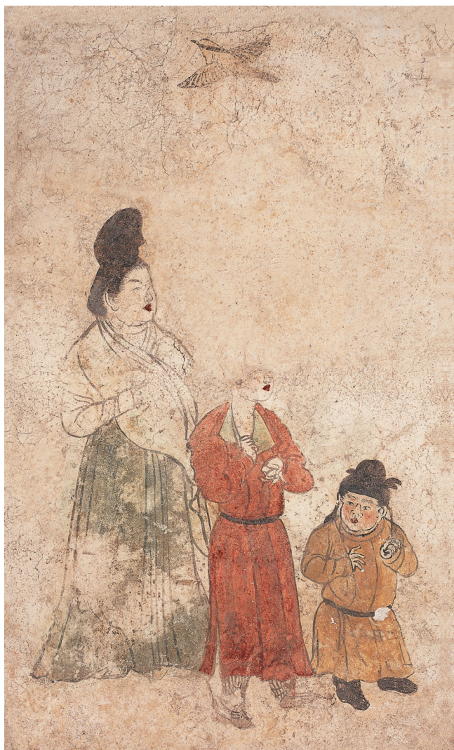
FIGURE 6 “Maid and Dwarf in the Tang Dynasty” is a fresco in the tomb of the Prince Zhang Huai of the Tang Dynasty. It measures 168 cm by 102 cm, and is the collection of the Shaanxi History Museum, Xi'an, China ( www.sxhm.com/index.php?ac=article&at=read&did=11550 )

In addition to figures portrayed as humble people in daily scenes, there is also a painting of a particular man with dwarfism who achieved important status ( https://www.cguardian.com/Auctions/