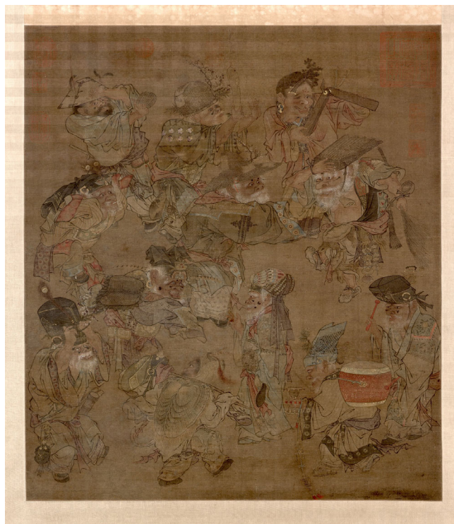
FIGURE 7 This silk painting of “The Great Nuo” is 67.4 cm long and 59.2 cm wide. It is part of the collection at the Palace Museum, Beijing, China ( https://www.dpm.org.cn/collection/paint/229433.html )

ItemDetail?id=632061&categoryId=1902&itemCode=908). Luo Ping (1733 AD–1799 AD), a famous artist in the Qing Dynasty, portrayed a scene (Figure 8) based on a well-known Chinese historical story “晏子使楚” ( Yan Zi's Visit to the State of Chu ). The main subject of the painting (wearing blue clothing) was Yan Zi, a famous official in the Warring States Period (475 BC–221 BC). He is much shorter than the other men (Figure 8), and appears to have typical characteristics of achondroplasia.