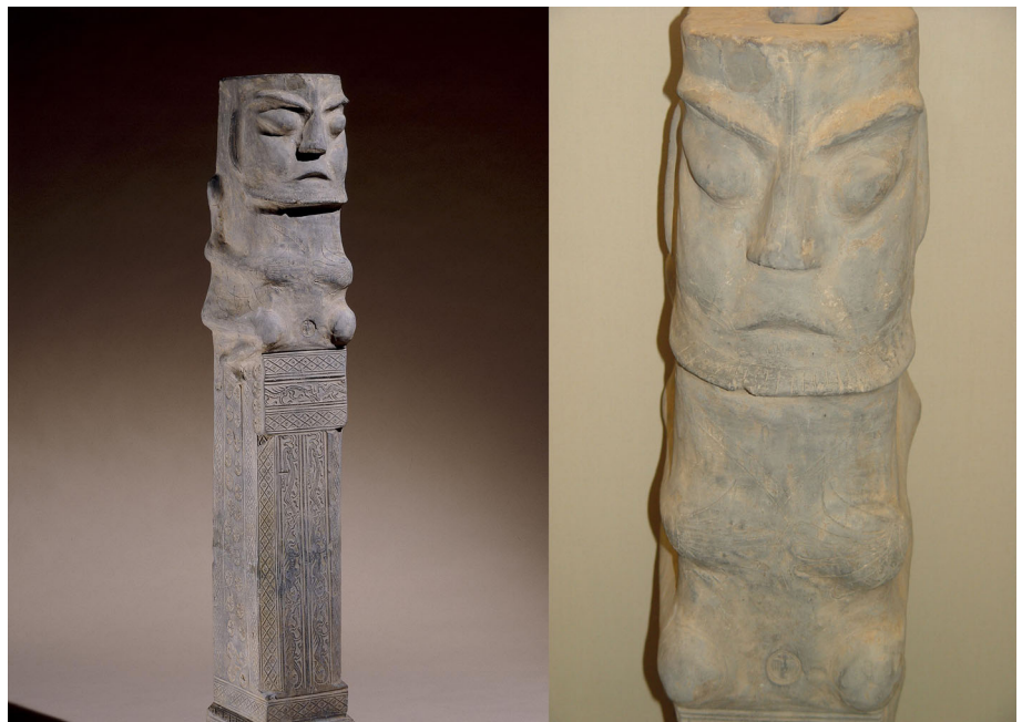
FIGURE 5 The “Grey Earthenware Pilaster” consists of ornaments of dragons, lozenges, and flower buds topped by “Bearded Man.” It measures 134 cm tall, and is part of the collection at the British Museum, London, UK ( https://www.britishmuseum.org/collection/object/A_1942-1010-1 )

The Great Nuo (Figure 7) is a silk painting (67.4 cm long, 59.2 cm wide) from the collection of the Palace Museum in China ( https://www.dpm.org.cn/collection/paint/229433.html ). It depicts a scene of Nuo