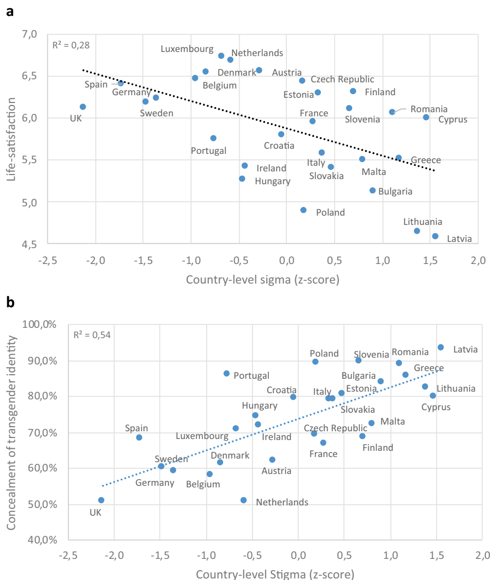
Fig. 2 a, b Mean country-level self-reported life-satisfaction (a) and mean proportion of transgender people reporting high level of concealment of their transgender identity (b) among transgender people across Europe by country-level structural stigma

The results presented in Fig. 3 show that concealment significantly mediated the association between structural stigma and life satisfaction and that this association was still significant in the context of discrimination (adj. \beta = -0.411 ; 95% CI -0.575, -0.247 ; p < 0.001 ). The indirect serial mediating effect of the association between country-level stigma and life-satisfaction (i.e., stigma \rightarrow concealment \rightarrow discrimination \rightarrow life-satisfaction) was also significant (adj. \beta = 0.070 ; 95% CI 0.034, 0.105 ; p < 0.001 ). Therefore, the results indicate that concealment of transgender identity mediates the association between structural stigma and transgender people's life satisfaction both directly and indirectly by reducing exposure to day-to-day discrimination.