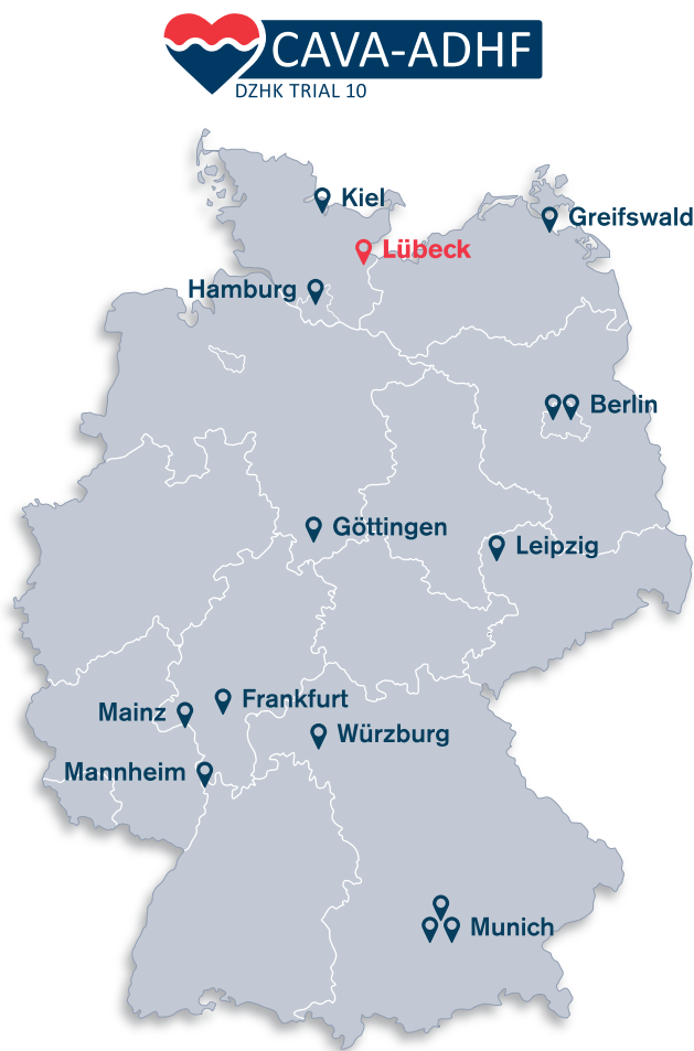
Figure 2 Geographical distribution of study sites.