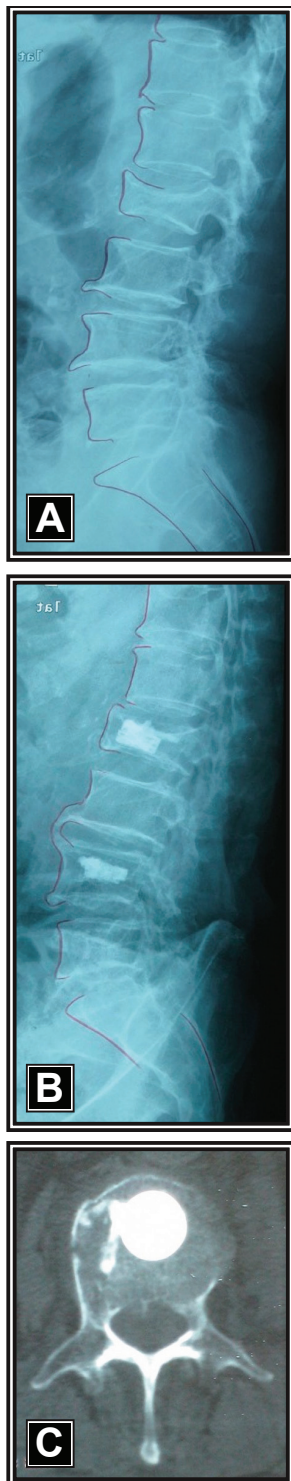
Figure 2 Preoperative lateral radiograph showing osteoporotic vertebral compression fractures at L2 and L4 in a 72-year-old female (a). Post-operative radiograph 6 months after treatment with the Kiva ® VCF Treatment System demonstrating excellent vertebral fracture reduction (b). Corresponding axial computed tomography scan at 6 months illustrating excellent cement containment within the implant at L2 (c).