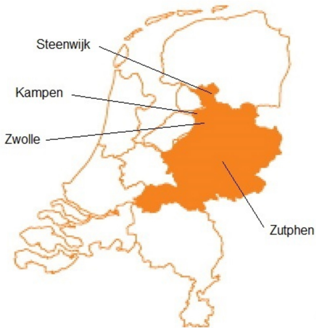
Figure 2 Participating centres.

Improvement on the KKL, in the final measurement compared with the baseline, showed no significant differences for all four centres, and also no significant differences with the overall Mindfit organisation in the year prior to the study (see table 1 ).