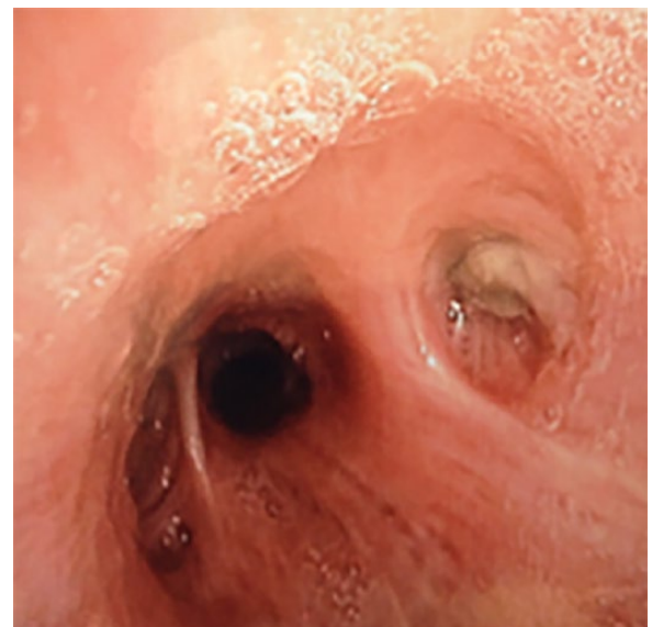
Figure 2. Bronchoscopy of a 41-year-old cystic fibrosis patient with allergic bronchopulmonary aspergillosis and Aspergillus bronchitis; a dense mucoid plug is responsible for obstruction of the apical segmental bronchus of the right lower lobe.

Allergic bronchopulmonary aspergillosis refers to a complex hypersensitivity reaction which often occurs in patients affected