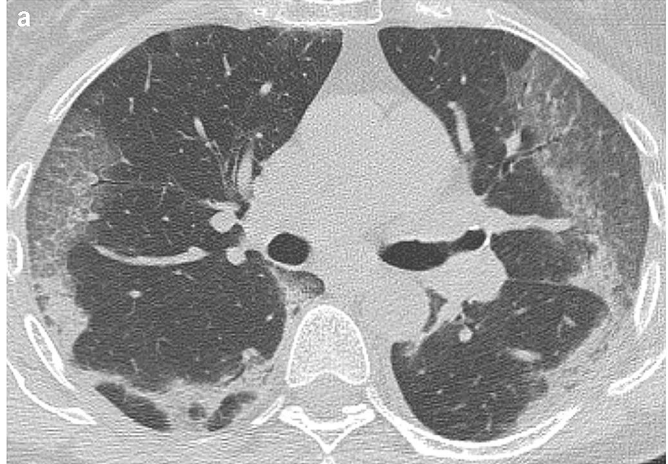
Fig. 2 61-year old woman with confirmed COVID-19 pneumonia. At hospital admission, HRCT images on axial (a) and sagittal (b) planes showed bilateral, peripheral GGO)and band-like opacities with a perilobular distribution, resembling an OP pattern. OP pattern was deemed present by all readers. After 5 days, the patient developed respiratory failure [Italian Society of Emergency Medicine (SIMEU) phenotype IV disease]