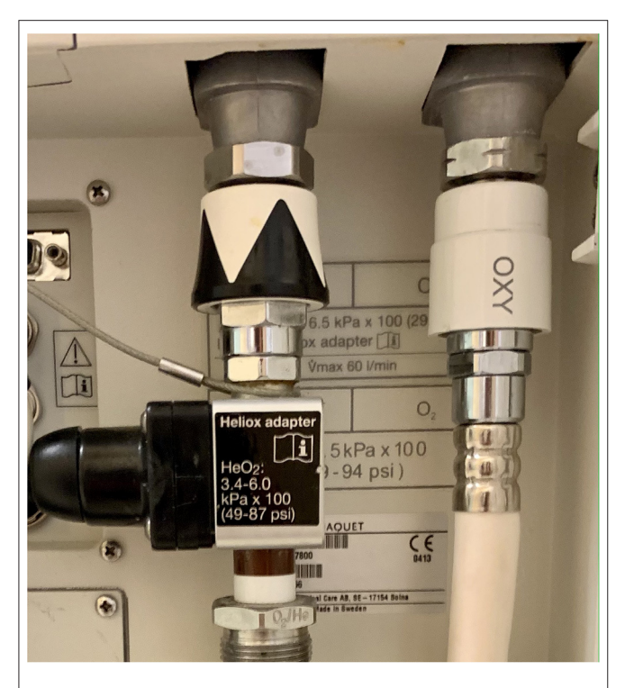
FIGURE 3 | Ventilator air inlet modified for Heliox delivery (Maquet Servo-I, Getinge, Sweden).