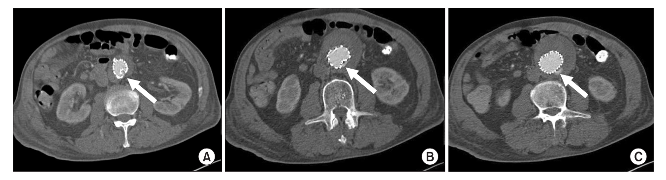
Fig. 1. (A-C) Computed tomography angiography demonstrating type I endoleak with posterior wall of stent-graft folded (arrows).

With a median follow-up of 12 months (range, 1–61 months), no further interventions for the type I endoleaks were required. The patients treated with an additional stent graft were followed-up for 35 months and there were no recurrences of endoleak on CT angiography. The patients treated with coil embolization 7 days after EVAR was lost to follow-up. In 7 patients who were managed conservatively, no recurrences of type I endoleak or sac expansion were observed on surveillance CT angiography (Table 2). The size of the aneurysm on CT angiography was reduced in 4 patients and remained unchanged in 3 patients.