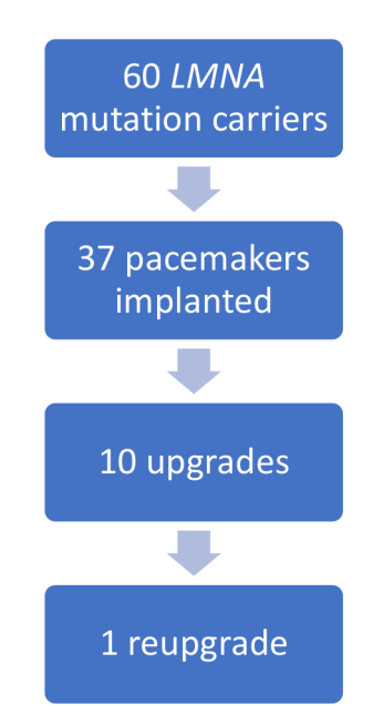
Figure 2 A flow chart of pacemaker implantations and upgrades.

the upgrade took place less than 2 years after the initial pacemaker implantation. The first device was implanted at an average age of 47.9 years (SD=9.5), whereas the upgrade took place at an average age of 50.3 years (SD=8.1). One individual received a second upgrade at age 59.2 years. By the end of data collection, 58.1% (18/31) of the men, and 65.5% (19/29) of the women (the difference was not statistically significant) had undergone device implantation. Men received the first device almost 10 years earlier (mean age 42.9 years, SD=8.1) than women (mean age 52.6 years, SD=8.4, p=0.001). Regarding device upgrade, the mean age for men was 48.3 (SD 9.1), and for women, 54.8 years (SD=2.5, statistically non-significant difference). Altogether 18 individuals received an ICD, 12 as the first device and 6 as an upgrade. Three of the ICDs were implanted after cardiac resuscitation, and one due to sustained VT as secondary prophylaxis, seven as primary prophylaxis, but with documented NSVT (non-sustained ventricular tachycardia), and the remaining seven as primary prophylaxis without known previous VT. At the time of the ICD implantation, 12 (66.7%) individuals fulfilled the echocardiographic DCM criteria whereas 6 (33.3%) individuals did not. Figure 3 shows the incidences of first recordings of