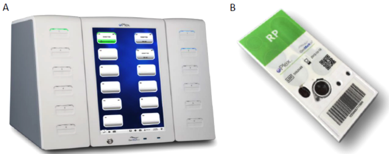
FIG 1 ePlex system (A) and the corresponding cartridge of the ePlex respiratory pathogen panel (B).

of fluorophores that can be used per reaction resulted in the need to run several real-time PCR assays to cover a broad range of relevant pathogens. Commercial assays using multiplex ligation-dependent probe amplification (MLPA), a dual priming oligonucleotide system (DPO), or a microarray technology were developed to overcome this problem and are able to detect up to 19 viruses simultaneously (8, 9). All applications mentioned require nucleic acid extraction prior to amplification. For routine diagnostics, these methods are most suited for batch-wise testing, with a turnaround time of ~6 to 8 h. To decrease the time to result and enable random access testing, syndromic diagnostic assays have been developed. These assays combine nucleic acid extraction, amplification, and detection in a single cartridge per sample and are suitable for decentralized or even point-of-care testing (POCT) with a time to result of <2 h.